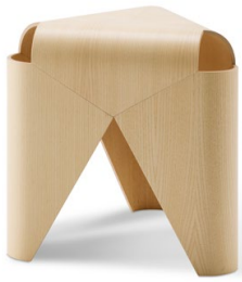
Falabella, stool Dimensions: W 411, D 411, H 440 Material: Laminated ash veneer*