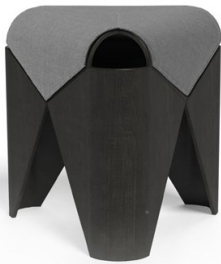
Falabella, stool Dimensions: W 411, D 411, H 440 Material: Laminated black ash veneer* Upholstery material: Fabric