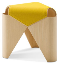
Falabella, stool Dimensions: W 411, D 411, H 440 Material: Laminated ash veneer* Upholstery material: Fabric