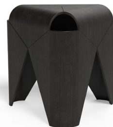
Falabella, stool Dimensions: W 411, D 411, H 440 Material: Laminated black ash veneer*