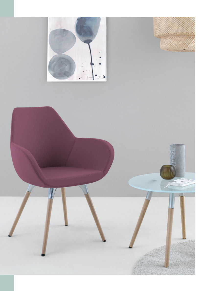
RBM Fan 10V